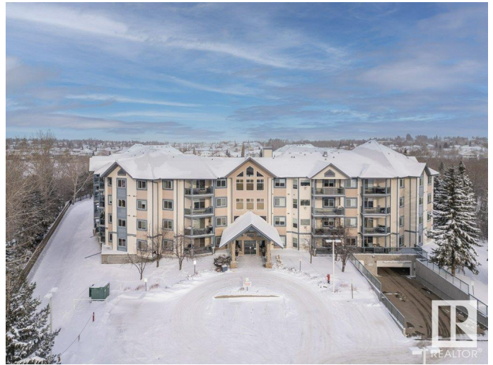
414-100 Foxhaven Dr, Sherwood Park, AB

VERY SPACIOUS, AIR CONDITIONED, TOTALLY RENOVATED 1809 SQ FT PENTHOUSE CONDOMINIUM OVERLOOKING THE COURTYARD AND HERITAGE LAKE. OVER 1900 SQ FT INCLUDING THE BALCONY. A VERY OPEN FLOOR PLAN FEATURING 2 BEDROOMS, DEN, 2 FULL BATHS, AND A COMPUTER ROOM. RENOVATIONS INCLUDE TOP OF THE LINE FLOATING LAMINATE FLOORING ON TOP OF A FOAM SOUND BARRIER, DESIGNER WHITE CABINETS, 6 CEILING FANS, ELECTRIC PANEL, SMOOTH CEILING, PAINT, AIR CONDITIONERS, QUARTZ COUNTERTOPS, & STAINLESS STEEL APPLIANCES. A VERY SPECIAL FEATURE OF THE PROPERTY IS THE FULL LENGTH BALCONY WITH A WONDERFUL VIEW. HERITAGE TRAIL GOES RIGHT BESIDE THE BUILDING AND RUNS BETWEEN HERITAGE LAKE AND THE WETLANDS - NATURE AT IT'S BEST OFTEN INHABITED BY PELICANS. THE COMPLEX COMES WITH AN EXERCISE ROOM, BILLIARD ROOM, LIBRARY AND ONE TITLED PARKING STALL. A GOERGEIOUS HOME IN A WONDERFUL SETTING.