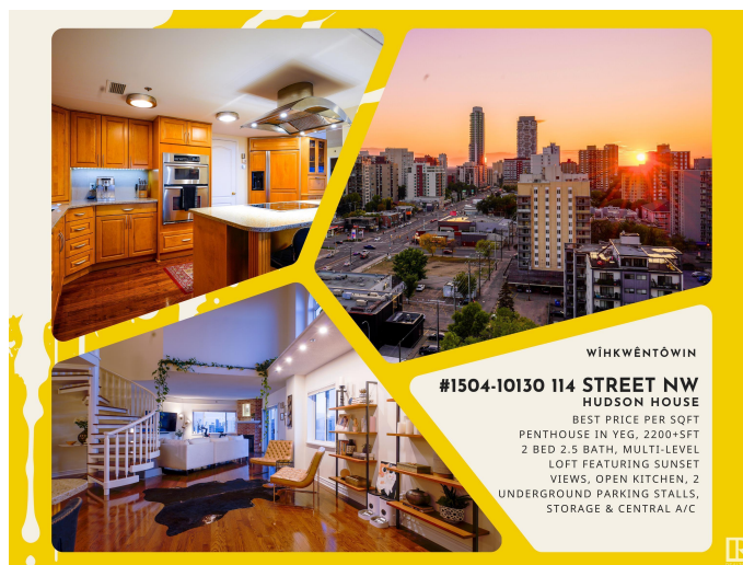
#1504 10130 114 STREET HUDSON HOUSE OLIVER, EDMONTON